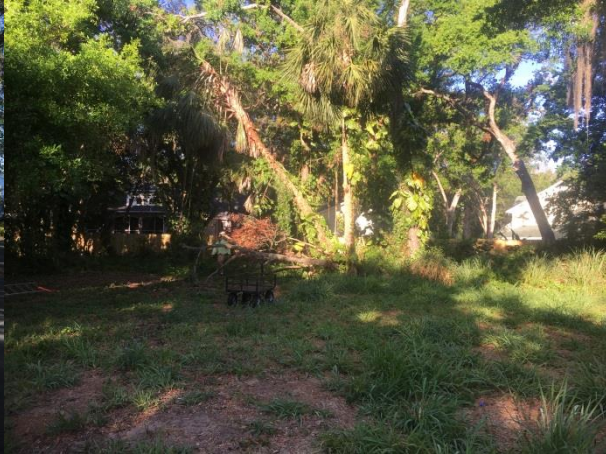
2 Geoff Barnett cuts up a larger fallen tree.